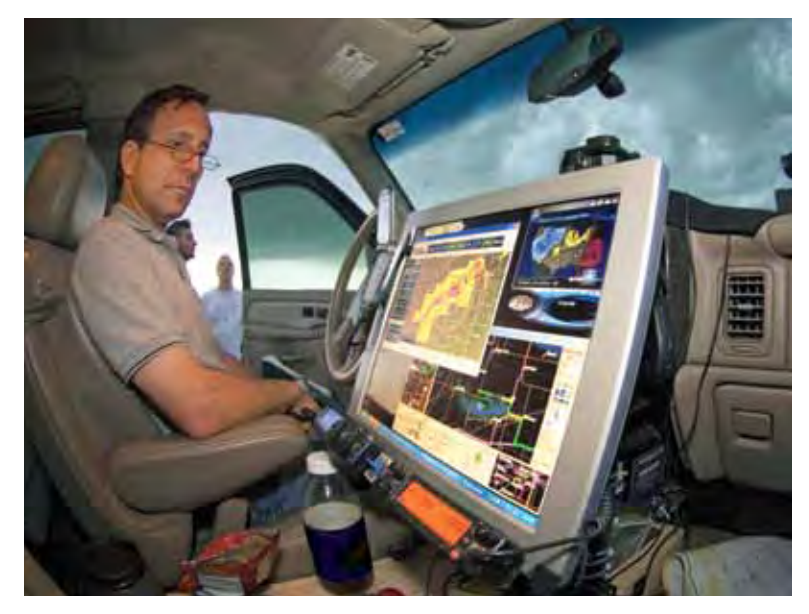
Storm chasers use computers to do their work. This storm chaser has a computer in his truck.

use what they find out to tell people if a storm is coming. They want to save lives. So they do tests. They check wind speeds. They look at computer models. They forget their fear and get close to the storm.