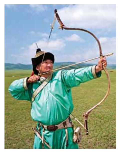
A Mongol archer

and friends grew stronger. This is how he became the leader of all the Mongols.