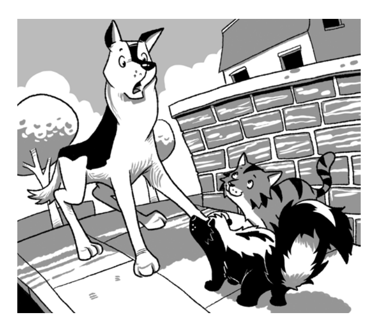
Tiger said, "What are you talking about?"

Pippa didn't move. She said softly, "Rosa is not a cat, Tiger."