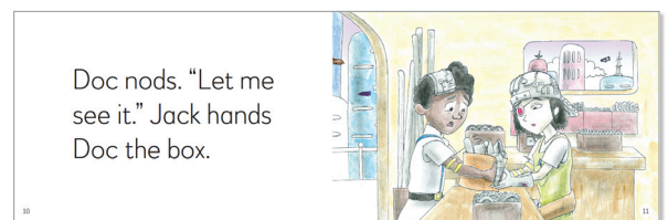
Set 4, Book 6

Order #2537-9 Sets 1 and 2 comprise a 20-book box set Order #2563-8 Sets 3 and 4 comprise a 20-book box set