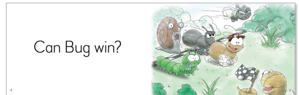
Set 1, Book 8

Lexiles: Sets 1 and 2 are lexiled at BR110–160. Set 3 and 4 are lexiled at BR90–380